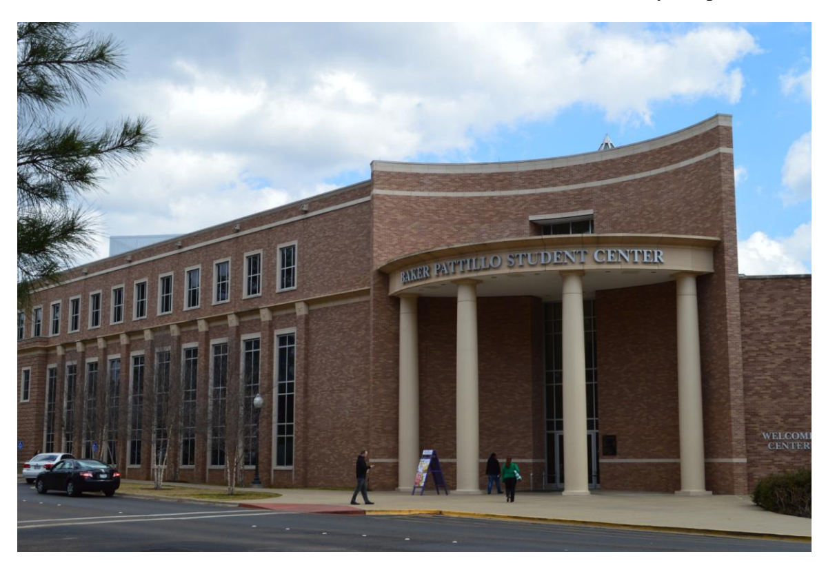
The Baker Patillo Student Center provided a wonderful location with spacious facilities.