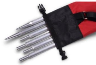
Poles - For single- and double-high mist nets and acoustic monitoring