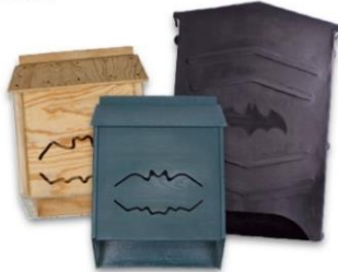
Bat Houses - Low-maintenance plastic shell with wood core, or traditional all-wood