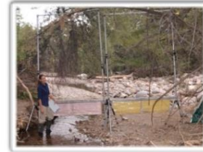
Harp Traps - Use at caves or mines, or to supplement mist-net surveys