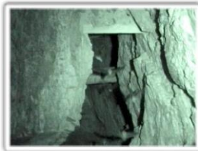
Monitoring Tools - Infrared video and thermal camera setups