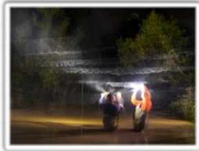
Triple-high Poles - Sturdy and durable, easy setup by a single tech

Professional Survey Specialists for Bat Capture, Acoustics, and Telemetry Support for Consultants & Agencies: Equipment • Artificial Roosts • Habitat Surveys • Technical Staffing