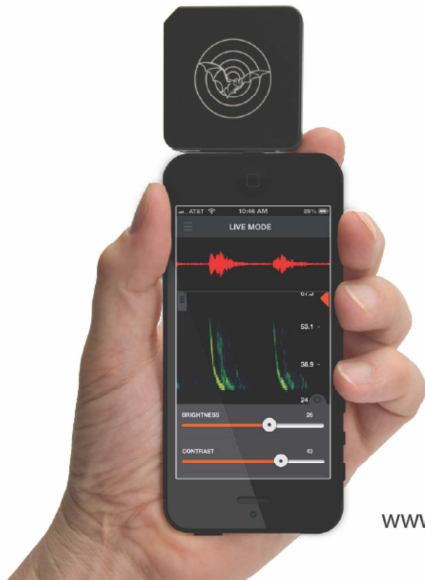
Echo Meter Touch