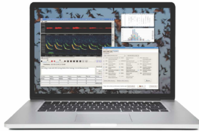
Kaleidoscope Pro Software