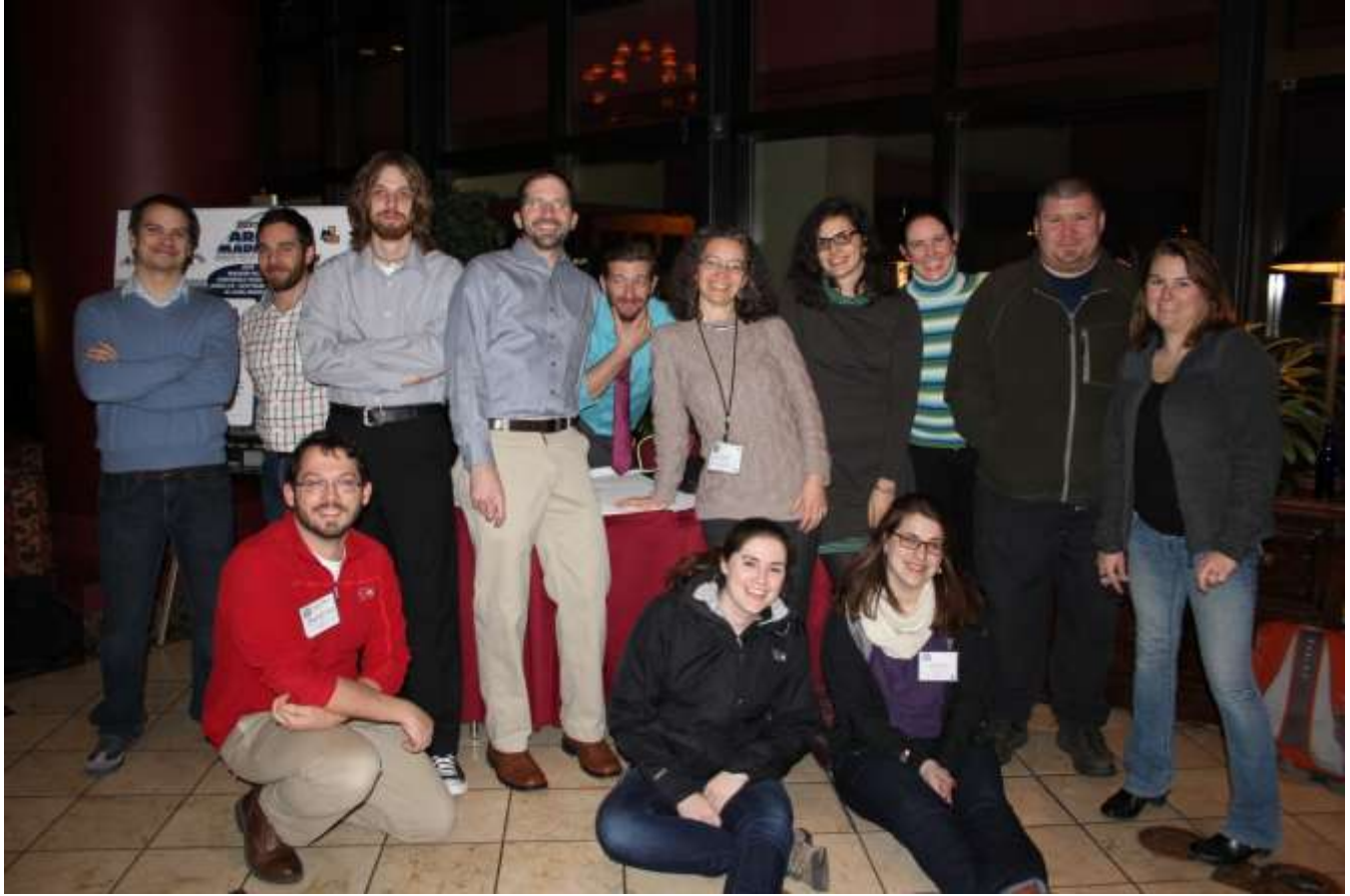
PHOTO OF ISU BAT CENTER STUDENTS AND DIRECTORS