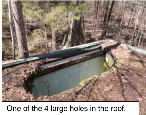
One of the 4 large holes in the roof.