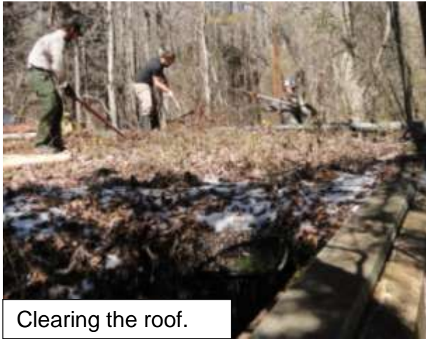
Clearing the roof.